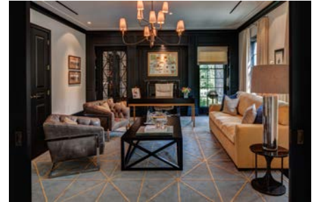
Design: Laura U Design Collective Color: Inkwell SW 6992

When we are designing midcentury modern spaces, we like to start with a traditional neutral hue as a base color, like Inkwell SW 6992. This allows you to add in vibrant midcentury hues with soft goods, like throw pillows or upholstered furniture.”