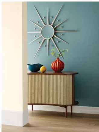
Color: Moody Blue SW 6221