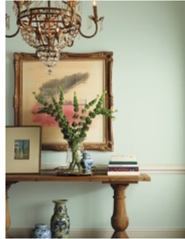
Color: Kingston SW 9677

Whether to get a second opinion on your color palette or the final push of encouragement you need to go bold, it's always a good idea to bounce ideas off of a color expert who is known specifically for their expertise and can help you see and identify opportunities to make the most of your chosen hue.