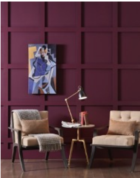
Color: Merlot SW 2704

Sherwin-Williams provides free virtual color consultations with experts designed to take the guesswork out of your repainting process. These 30-minute meetings can be whatever you need them to be, from big-picture ideation to guidance on complementary colors for your walls. You will also receive a personalized project plan based on the conversation. If you choose to consult a color expert before ordering samples of your own, they can even help send color chip samples right to your home post-consultation to help you bring your vision to life.